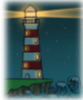
igh a light in the night