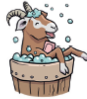
oa soap that goat

Words to blend this week: bang fish wait web pin tight feel deep right this that