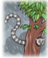
ai tail in the rain