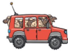
ee sheep in a jeep